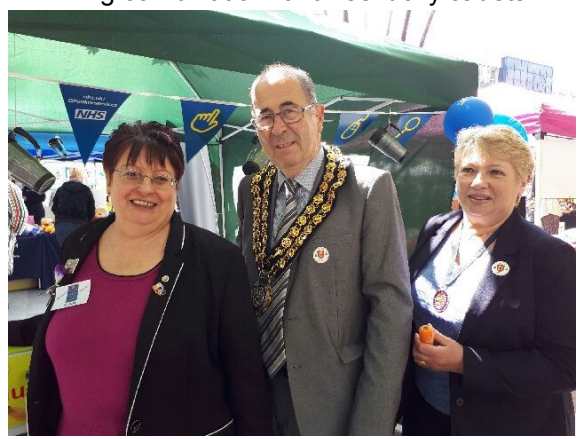
Chain reaction as Mayor visits the CCG stand