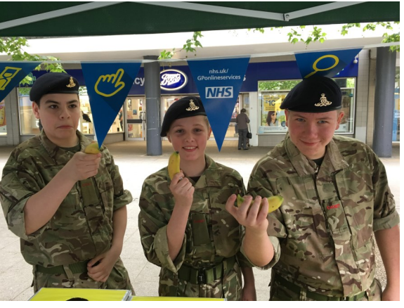
Winning combination for three lucky cadets

If you are organising a community event and would like to